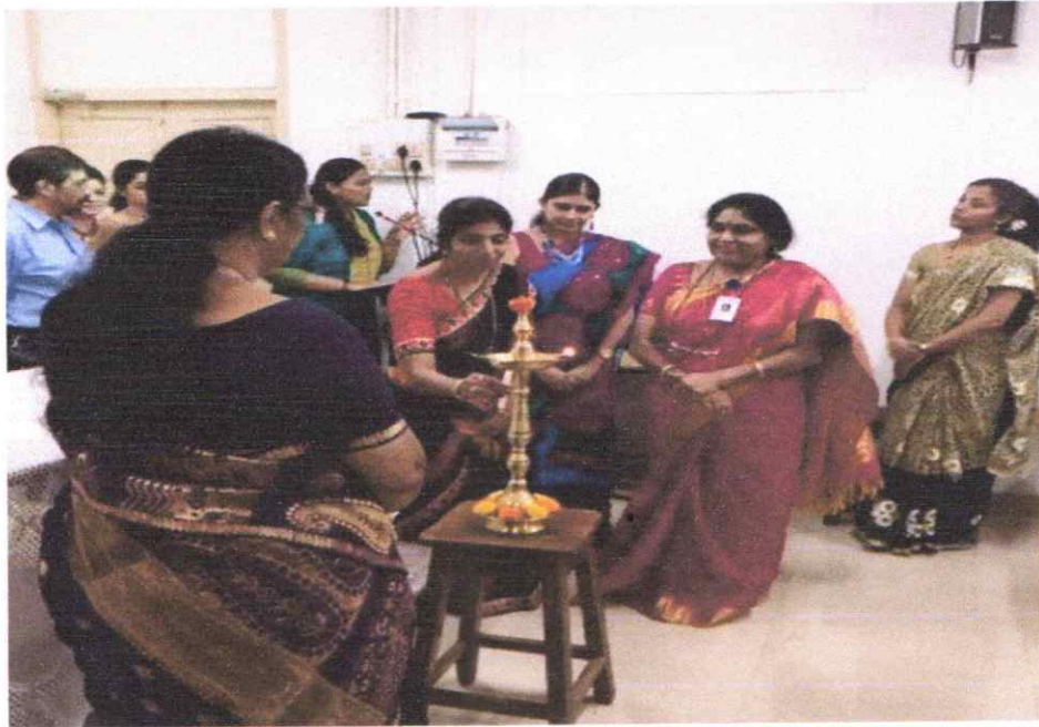
'May the lights spread' .... Lighting the Lamp at the inaugural session of Revised Syllabi Workshop for M. Com Semesters III and IV held on 19 th August, 2017.