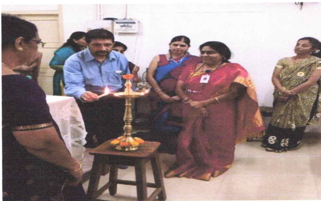
'Let there be light' .... Lighting the Lamp at the inaugural session of Revised Syllabi Workshop for M.Com. Semesters III and IV held on 19 th August, 2017.