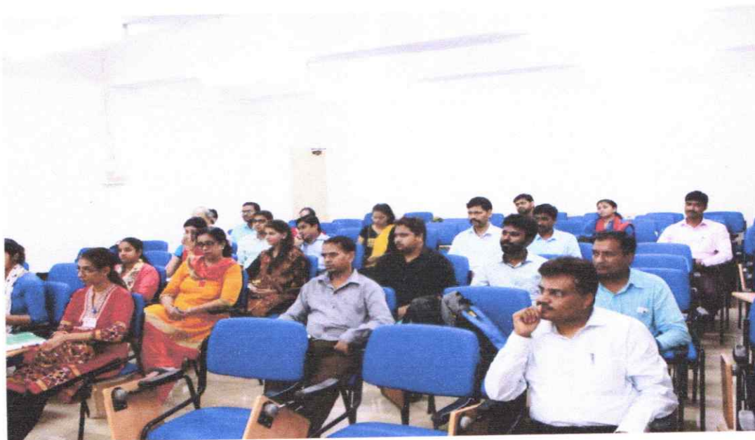
A view of cross - section of the audience at the S.Y.B,Com. Revised Syllabi workshop on 12th July, 2017.