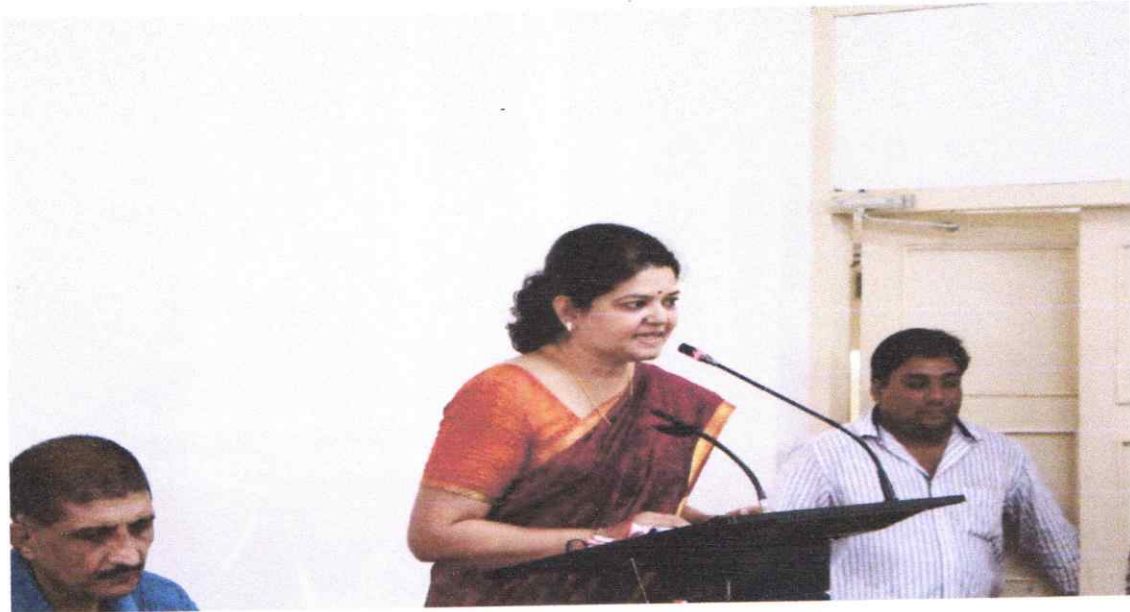
Welcome to all ..... Welcome speech at the S.Y.B,Com. Revised Syllabi workshop on 12th July, 2017.