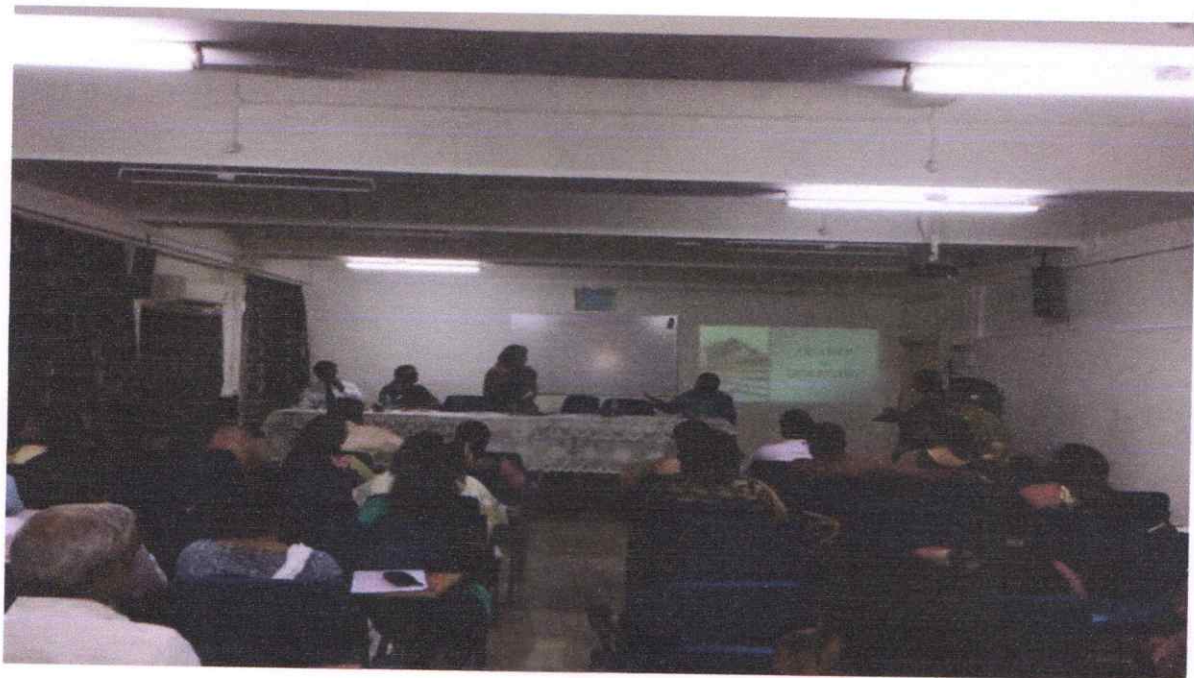
Deliberating on some technical aspects of a topic at the Revised Syllabi Workshop for M.Com. Semesters III and IV held on 19 th August, 2017.