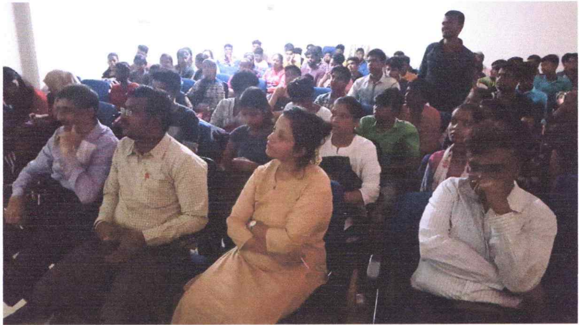
Participation of Teachers in the talk on Budget – 18 th February, 2019