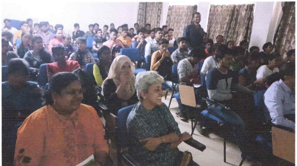
Participation of Teachers and Students in the talk on Budget – 18 th February, 2019