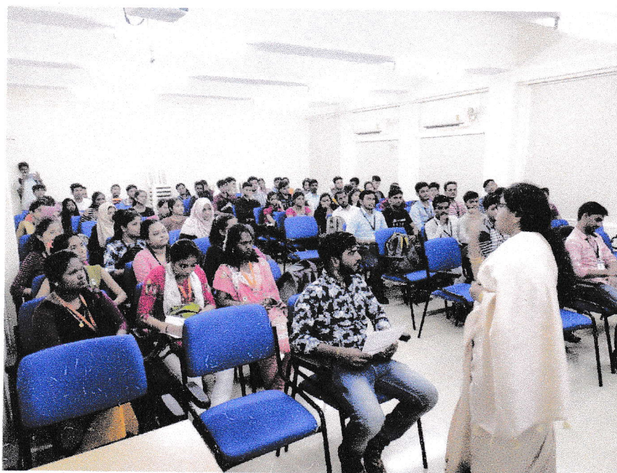
Principal Madam addressing students with a welcome speech