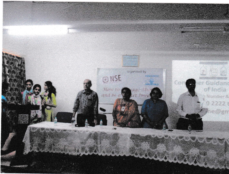
Inaugural session with a prayer song