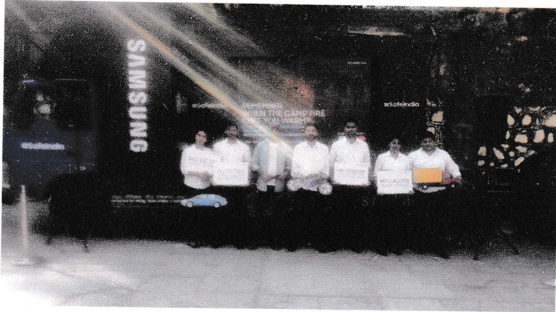
Artists from National School of Drama performing a skit on Road Safety

Plot No. 337, Sewri - Wadala Estate, Major R. Parameshwaran Marg, Wadala, Mumbai – 400 031