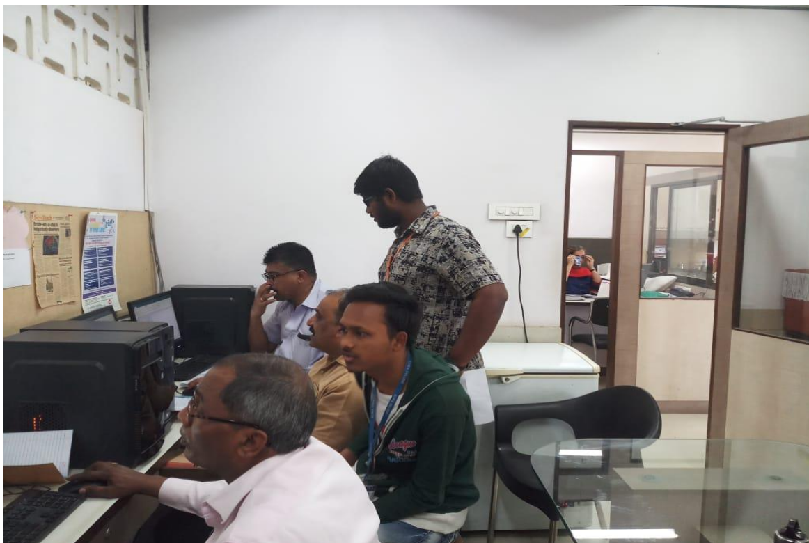
Students of D.L.L.E. teach basics of MS Excel to Laboratory attendants