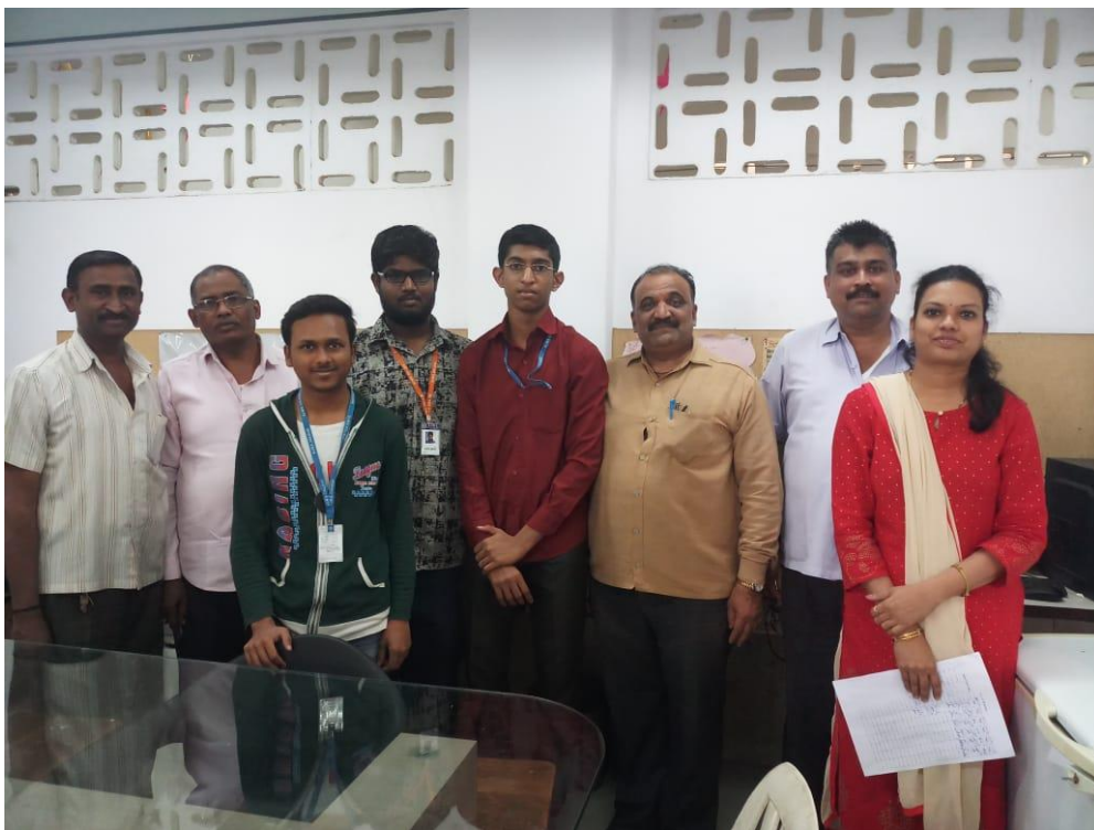
Four laboratory attendants were given hands on training by students