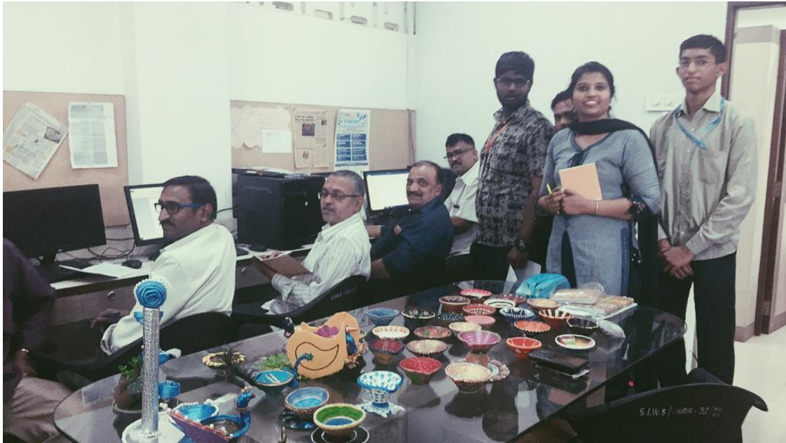
Students of D.L.L.E. teach basics of MS Word to Laboratory attendants